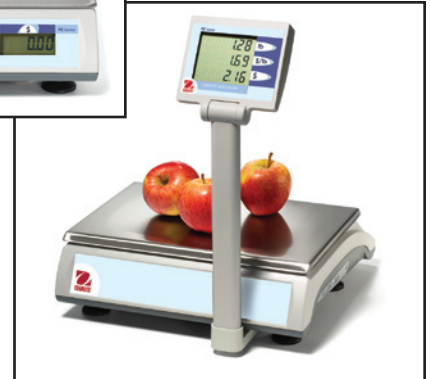
Model RE shown with rear display (top) and tower mount model (bottom)