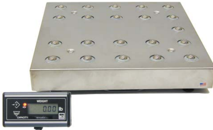
NCI Model 7885 shown with optional ball-top weight platter