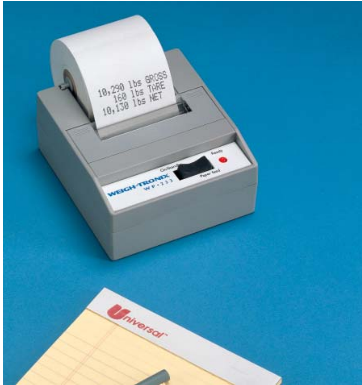
WP-233 Dot Matrix Impact Printer